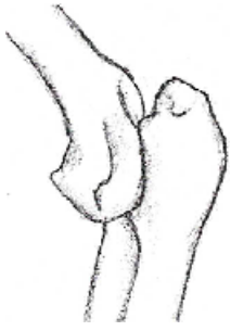
Figure 3: The elbow bones have ridges that slide into interlocking grooves

the bones of the carpus do not have ridges that slide into interlocking grooves on the adjacent bone. The relatively loose fit of the carpal bones is supported by ligaments that join each of the carpal bones to the adjacent bones.