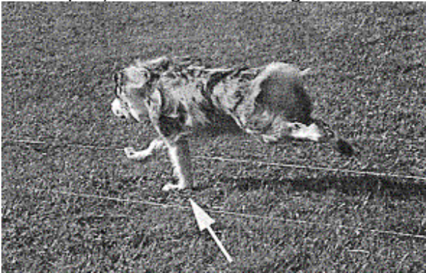
Figure 1: The accessory carpal pad of the lead front leg touches the ground.

In the canter, there is a moment during each stride when the dog's accessory carpal pad (on the back of the carpus) of the lead front leg touches the ground (Figure 1) and the rear legs and other